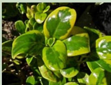
Plant of the Month Coprosma repens